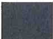
679 Blarney Stone