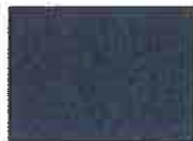
719 Carbon Char