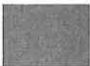
837 Biscotti Crunch