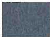
928 Majolica Tin