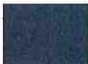
559 Anodized Lapis