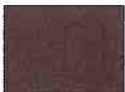
374 Terra Clay